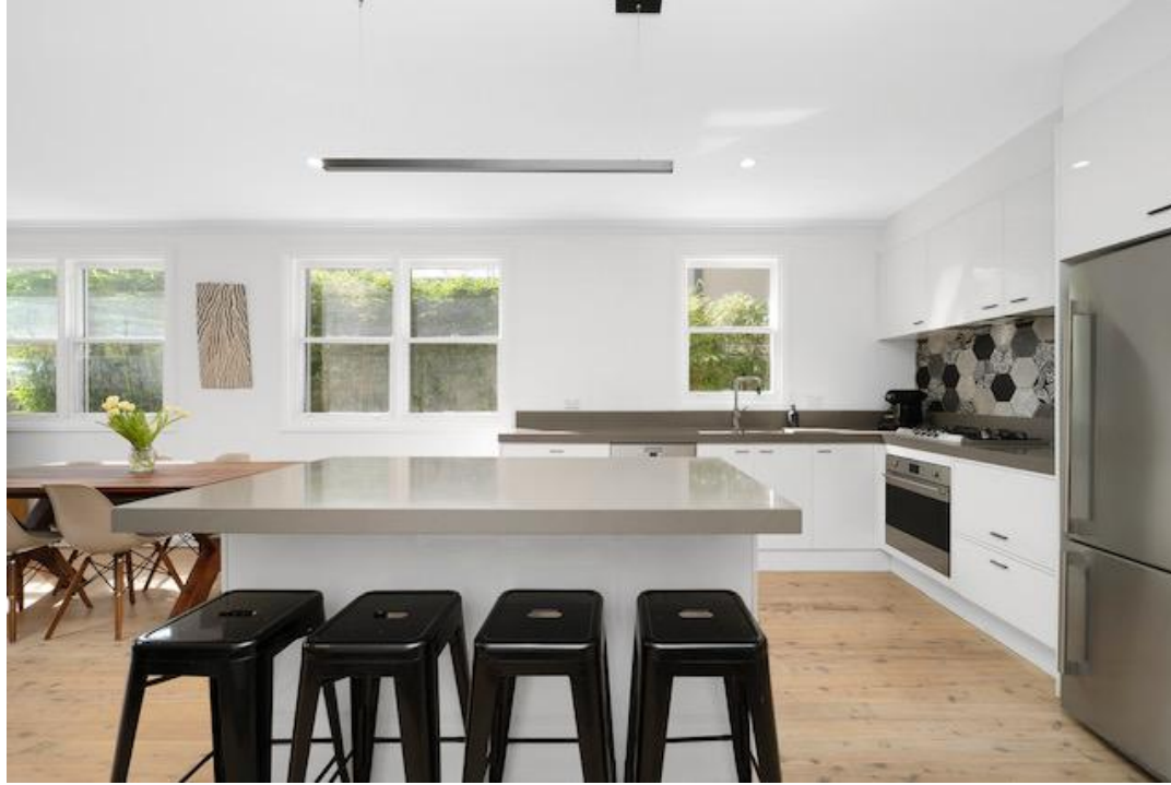
Modern stone island kitchen, dishwasher and gas cooking